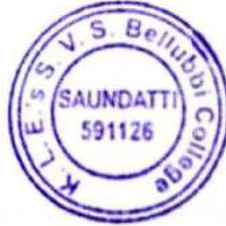
PRINCIPAL K.L.E.Society's S.V.S.Bellubbi Arts & Com College,Saundatti.