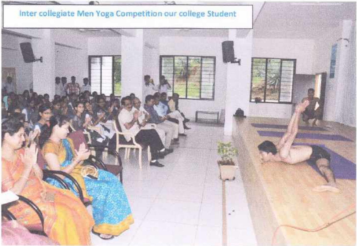
Inter collegiate Men Yoga Competition our college Student