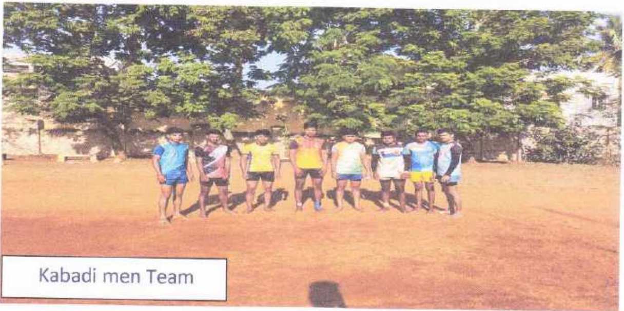
Kabadi men Team