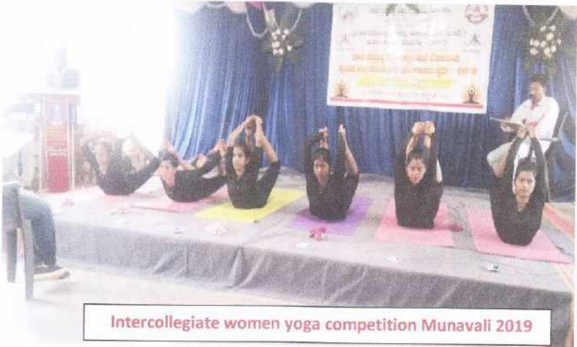
Intercollegiate women yoga competition Munavali 2019