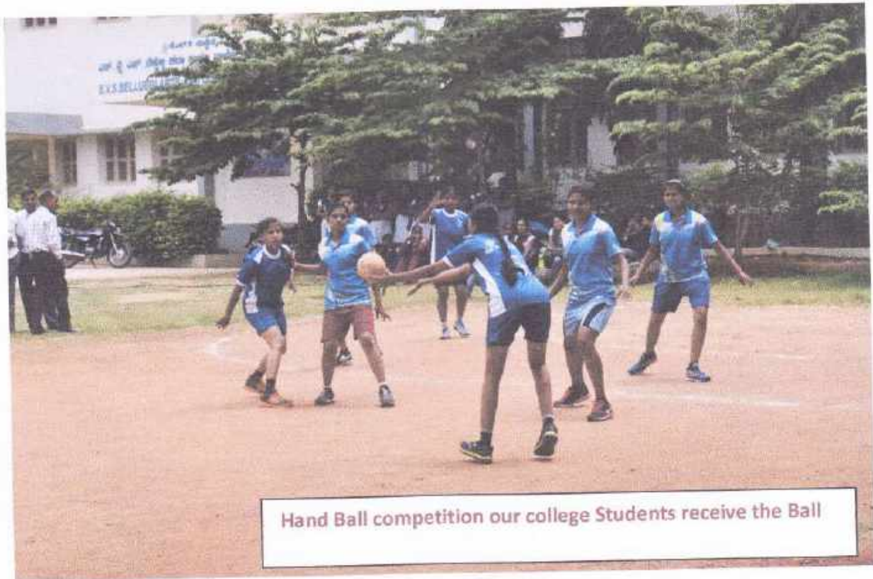
Hand Ball competition our college Students receive the Ball