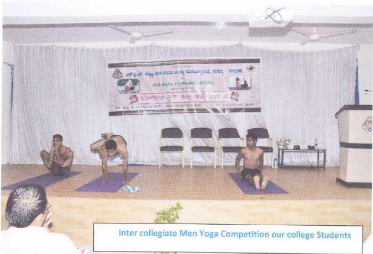
Inter collegiate Men Yoga Competition our college Students