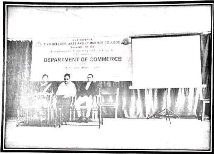
Staff & Students participation in the CMA workshop